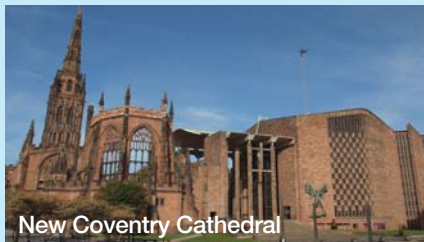
New Coventry Cathedral

NB:- Please note we reserve the right to alter the above itinerary if required for operational reasons. Given the historic nature of the places visited, a certain degree of walking will be involved, and this holiday may not be suitable for those with mobility problems.